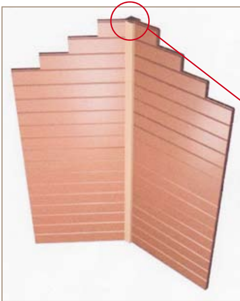
Two socket post (90°+45° - left)